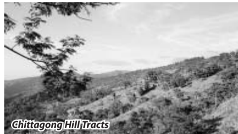
Chittagong Hill Tracts

A Gospel for Asia leader in Bangladesh narrowly escaped with his life when he was caught up in a violent clash between two warring ethnic groups. The leader was picking his children up from school on February 24 when he was caught up in one of the riots. He was able to return home unharmed, but he is asking for prayer for the country.